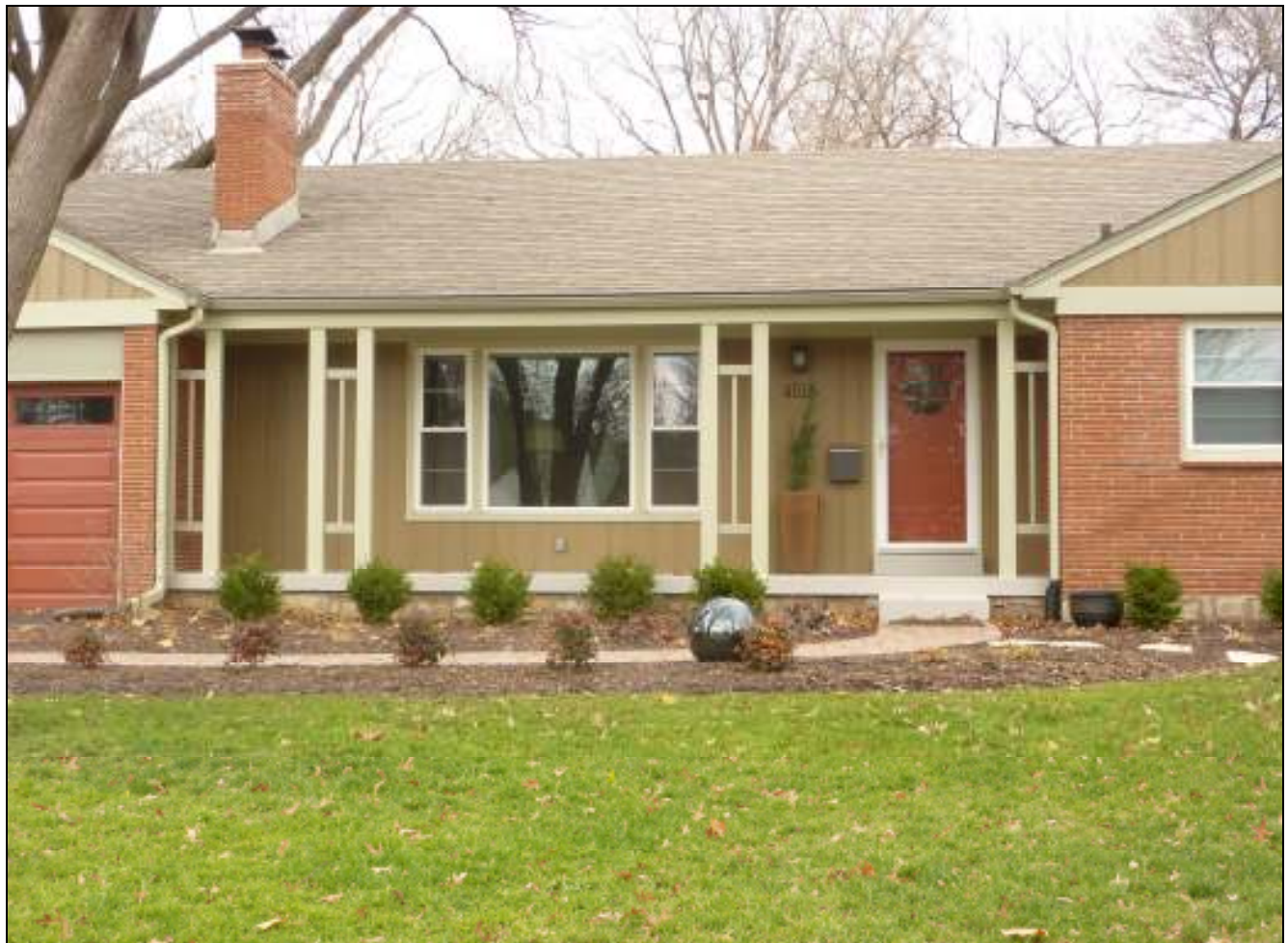
A close-up view of the house with good bones and enhanced personality.

Color and design can make such a difference to an entry. This home has had drama added with different values of the same color. Windows in a cream, gold for the trim and a vibrant gold on the front door adds a centering at the door. To make the body of stucco a background a tan color coordinates with the stone mortar color between stones seen on the left side of the door.