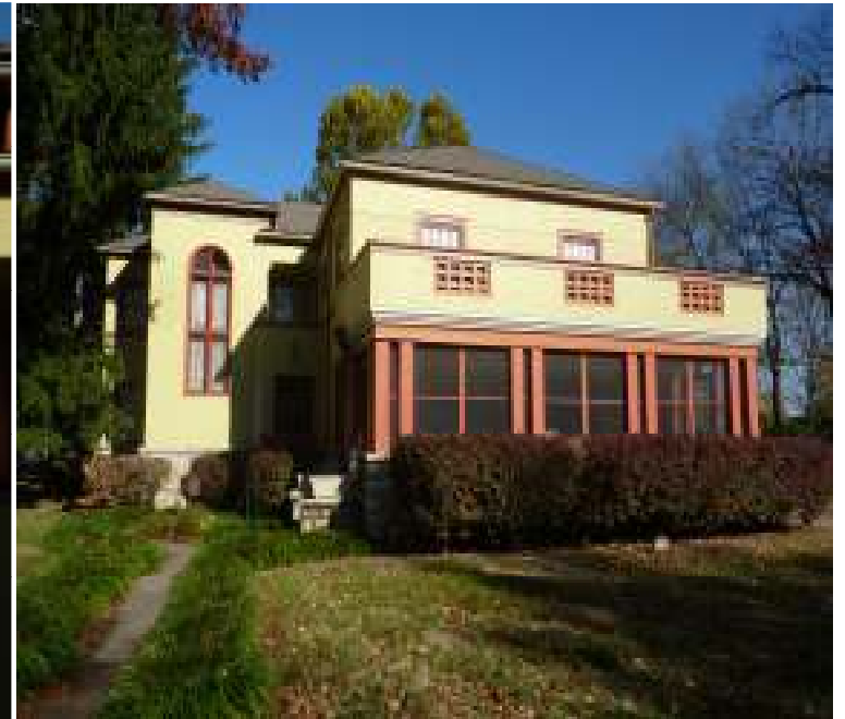
This Maple St. residence is an interesting combination of Deco and Mediterranean styling. The home, once grey is now alive with enhancements to its lovely details.