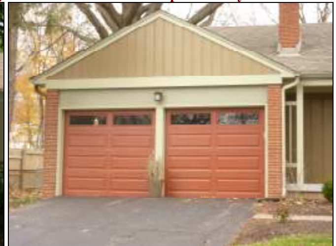
A close-up view of the garage then and now.