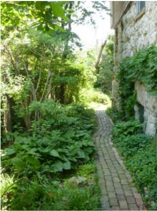
Next year the shaded beds will appear much like one of our past HYDE PARK landscape installs. Above is a shaded location with meandering pathway and variety in ground covers and perennial plantings.