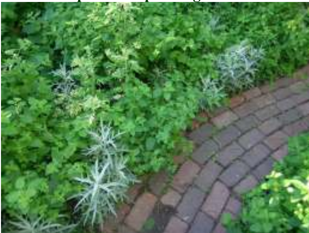
Variation in plants provide texture and color.